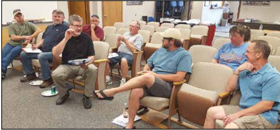
On Saturday, June 3, members from Akima Technical Service gathered at the Spokane Union Hall to identify issues of importance for a first contract. Formal negotiations for a first contract begin on July 18.

These workers provide aircraft and equipment maintenance to helicopters the U.S. Air Force uses in flight crew training at the USAF Survival School. These workers prepare aircraft before crew arrival, assist during flight preparations, and then recover, inspect and service each aircraft before the next launch.