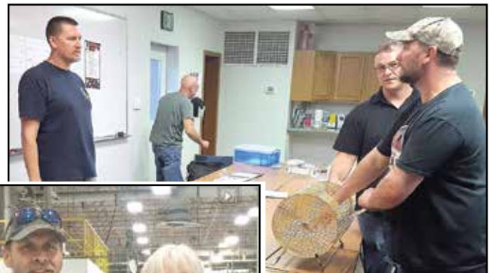
Above: Winning Guide Dogs Raffle tickets were drawn at the June 6 Local 1951 meeting in Richland.