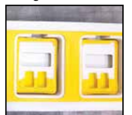
The new mold that holds multiple door latches for painting.

Every day across Puget Sound our IAM Work Transfer Reps search for potential alternatives to keep work in-house by meeting with our members to brainstorm innovative ways to perform the work more efficiently – just one more way our union is working to preserve our jobs.