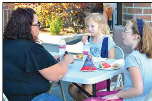
Many members bring their families to the August barbecues and local lodge meetings.

Local F (inspectors, toolroom clerks and MPRFs) — 5 p.m. Aug. 9 and 10 a.m.