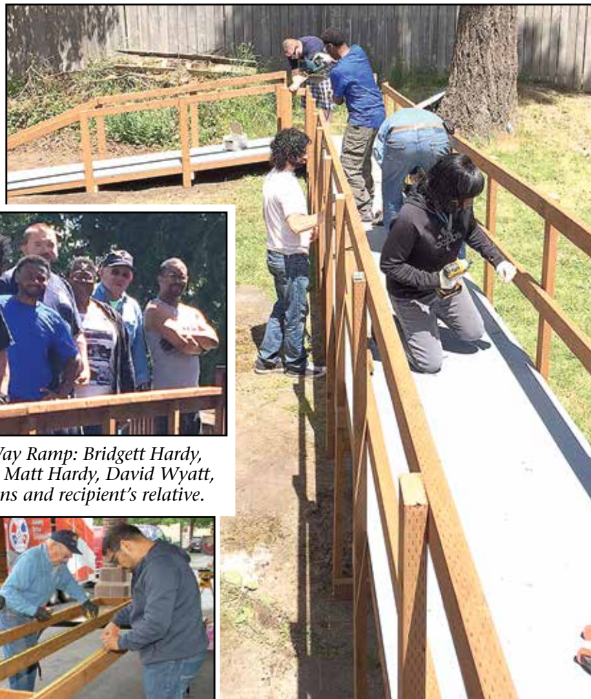
The Federal Way ramp was long to ensure the grade wasn't too steep for the resident.