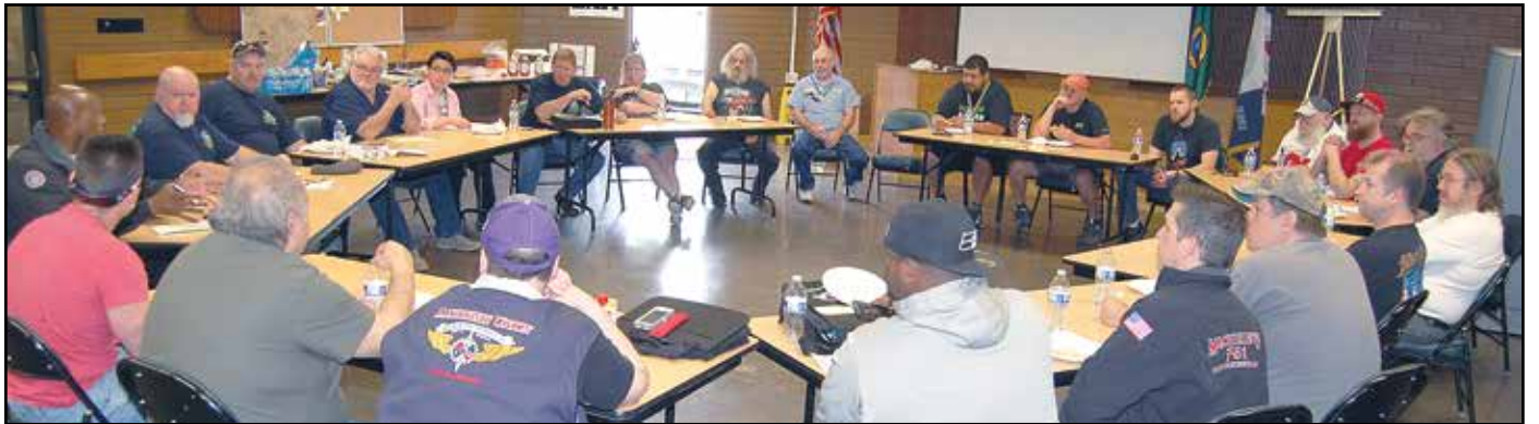
The Auburn membership forum promoted group discussion on current issues, sharing of information and brainstorming unity activities members can do to make us stronger.

Concerned members meet to discuss issues, share information, get answers