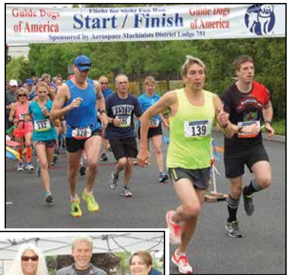
Above: Runners take off at the start.