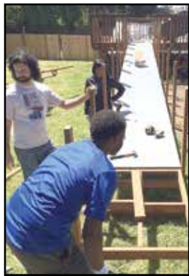
Right: Assembling the Federal Way ramp.