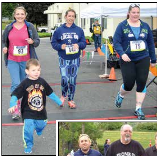
Above: Runners on the course Left: Coming to the finish.