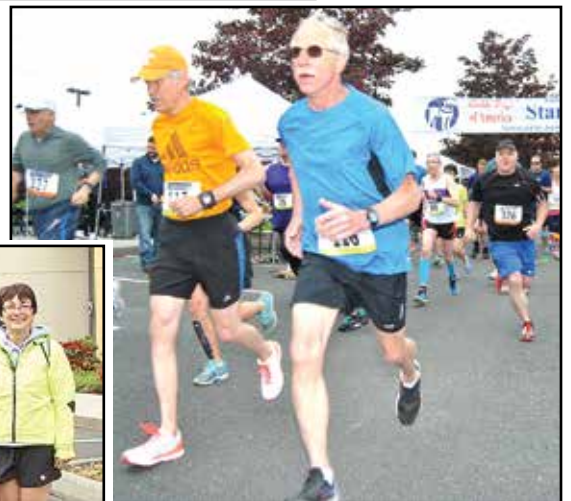
Above: Runners take off at the start. Left: Winners in all age categories pose for a photo along with Guide Dogs who attended. Find winners and photos at www.FlightForSight.com

Visit www.flightforsight.com for complete race results and photos.